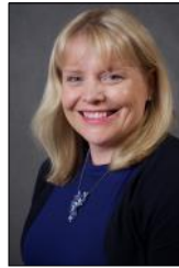
Vice-Chairman of Scrutiny Panel A