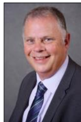
Vice-Chairman of Scrutiny Panel B