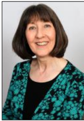
Chairman of Scrutiny Panel A