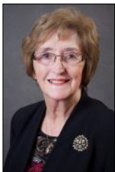
Chairman of Scrutiny Panel B